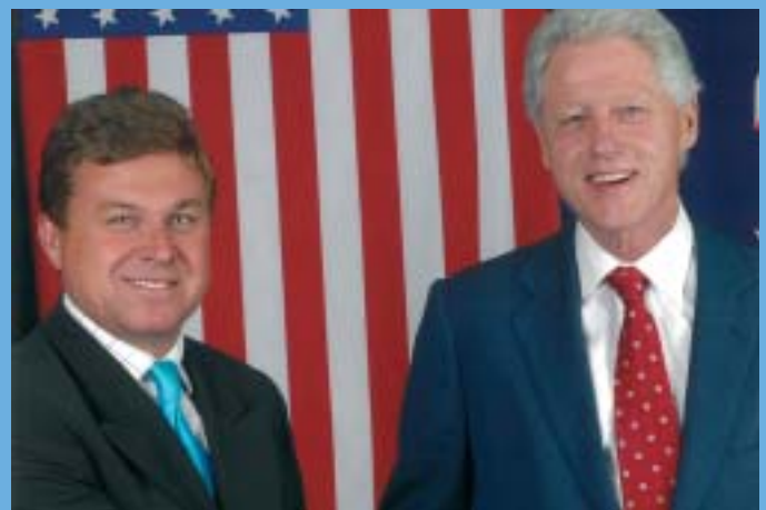
Rupert Ward of the Migration Bureau meets Bill Clinton.